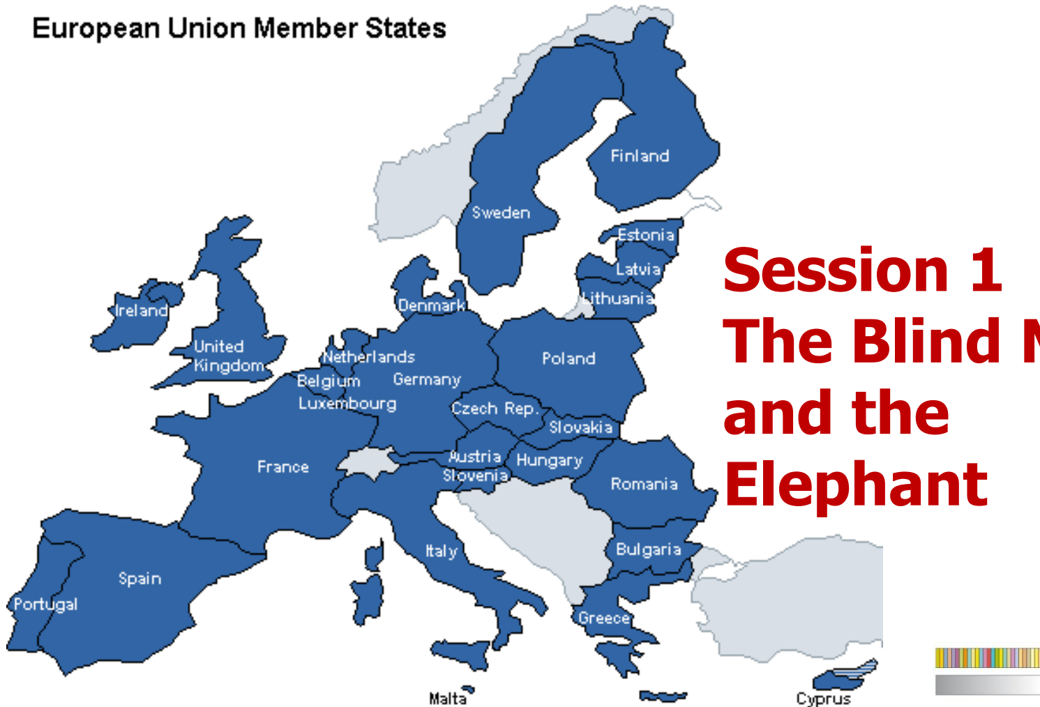
European Union Member States